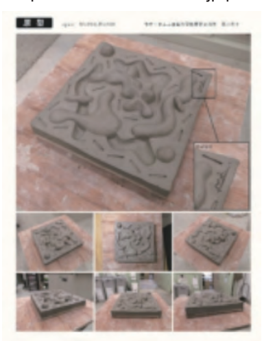
1. Prototype made by participants with some material (e.g. clay)

https://www.autodesk.co.jp/products/recap/features